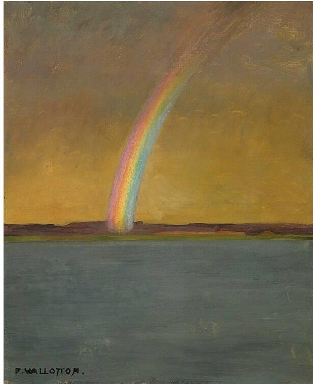
painting by F. Wallotton

Every healthy community works out a balance between change and continuity. That has certainly been true of Orinda Community Church in the past year. I enter 2023 with confidence that we are a healthy church—a place of living faith, energy to pursue justice, and affection and commitment abounding amongst us. I am very grateful for you.