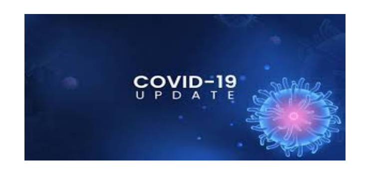
COVID Advisory Group: Update

As an acknowledgement to the uptick in regional COVID cases, the COVID Advisory Group met this week. After some reflection and conversation, we decided that we simply want to reaffirm the health and safety suggestions we had previously adopted: