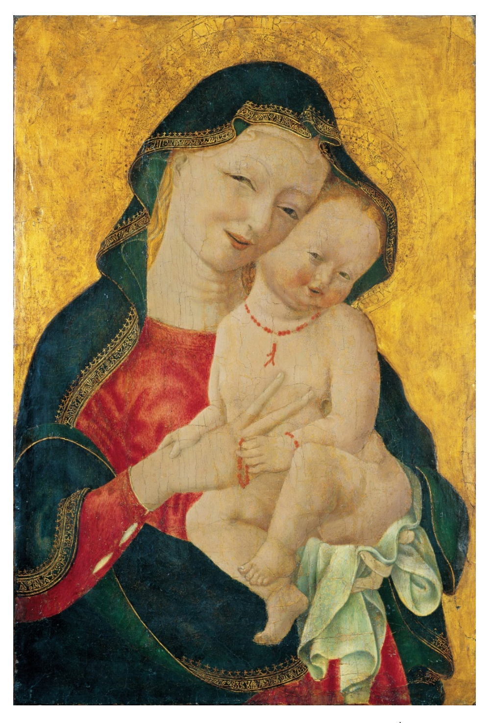
Master of the Winking Eyes, from the Grimaldi Fava Collection, 15th Century