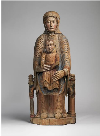
12 th Century French Sculpture

Sunday, December 12, 2021, 10 am Third Sunday of Advent