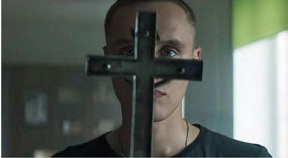
Still from the film "Corpus Christi"