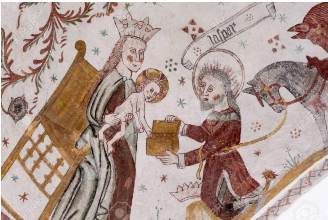
Medieval fresco from Tingsted Church, Denmark