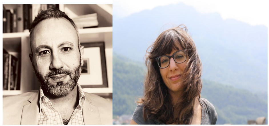
February 12, 2023 at 4:00pm (Pacific)

To Register for this free online event, check your eblast or go to our website orindacommunitychurch.org and look under "Arts" and "Alta Mesa Center for the Arts" or go directly to: https://www.maryvolmer.com/alta-mesa-center-for-the-arts.html