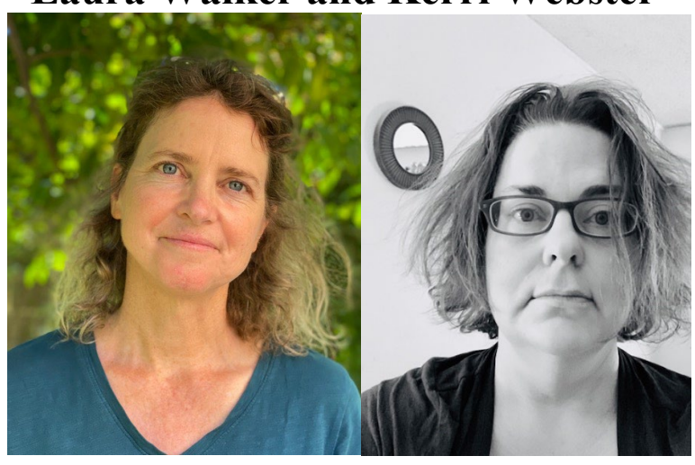
To Register for this free online event, check your eblasts or go to: <a href="https://forms.gle/5LtRT65NTAGhqBAS6">https://forms.gle/5LtRT65NTAGhqBAS6</a>