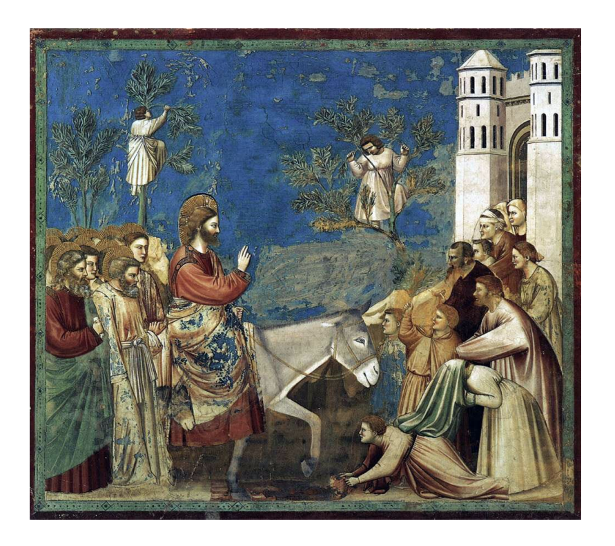
Painting by Giotto