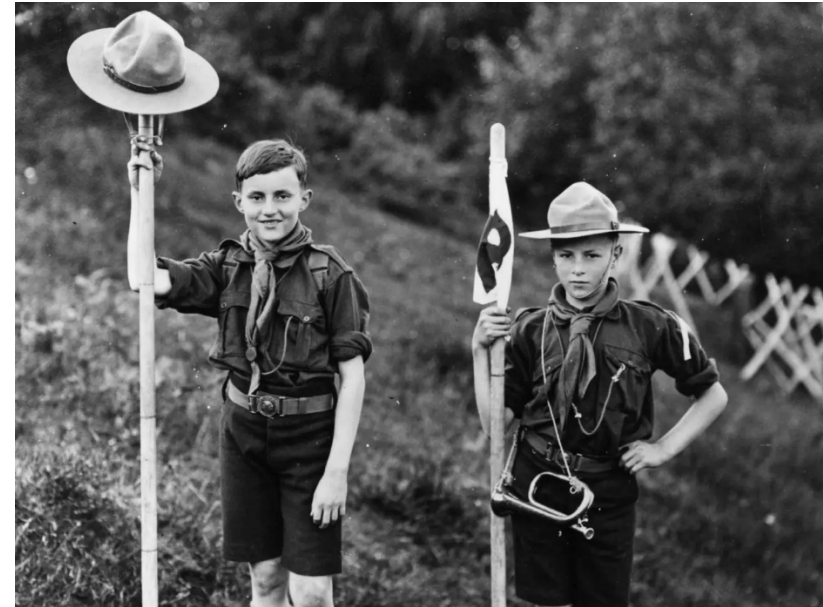
circa 1910