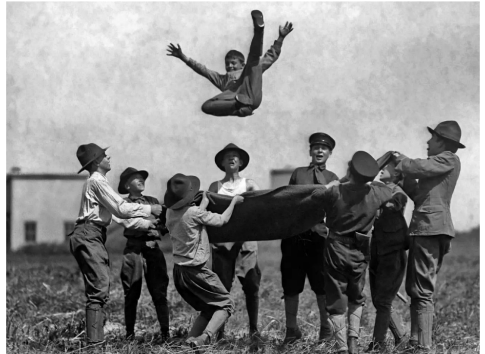
Getty Images, circa 1910

Please join Troop 237 in Fellowship Hall after the service today, for brunch!