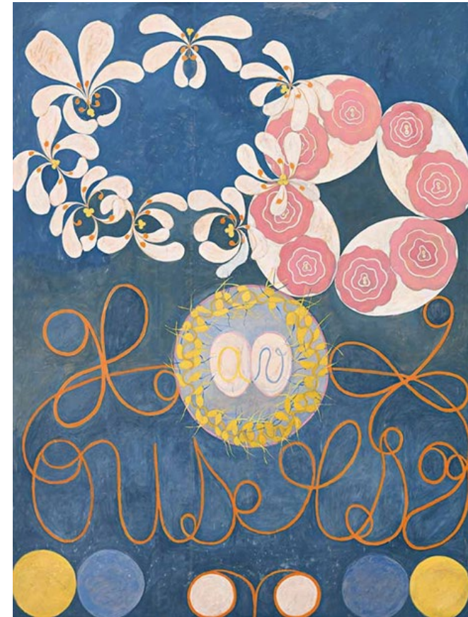
Painting by Hilma af Klint