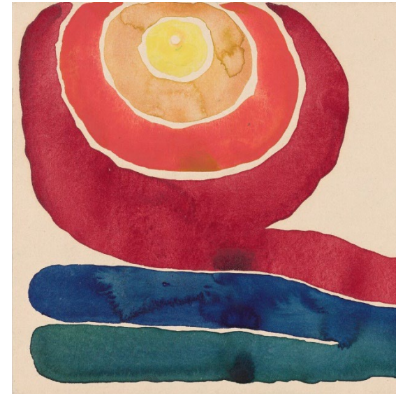
Painting by Georgia O'Keefe