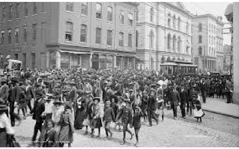
Juneteenth Celebration Photo circa 1900