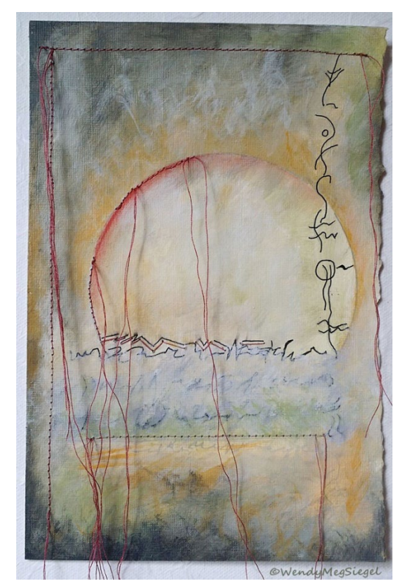
art by Wendy Meg Siegal

Reflection: Before I can say I am , I was. Heraclitus and I, prophets of flux, know that the flux is composed of parts that imitate and repeat each other. Am or was, I am cumulative, too. I am everything I ever was... I am much of what my parents and especially my grandparents were -- inherited stature, coloring, brains, bones (that part unfortunate), plus transmitted prejudices, culture, scruples, likings, moralities, and moral errors that I defend as if they were personal and not familial. — Wallace Stegner