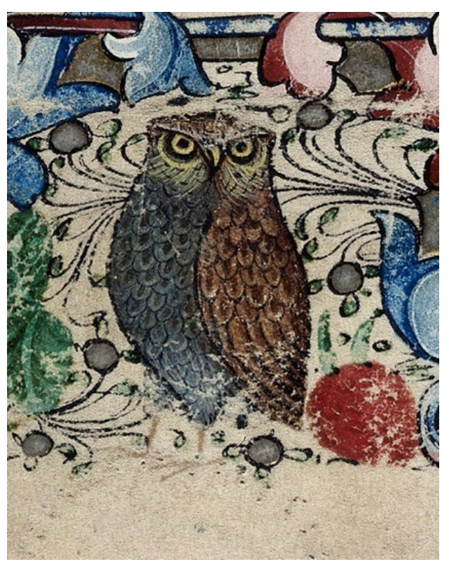
Owl, Book of Hours, London, c. 1460; Harley MS