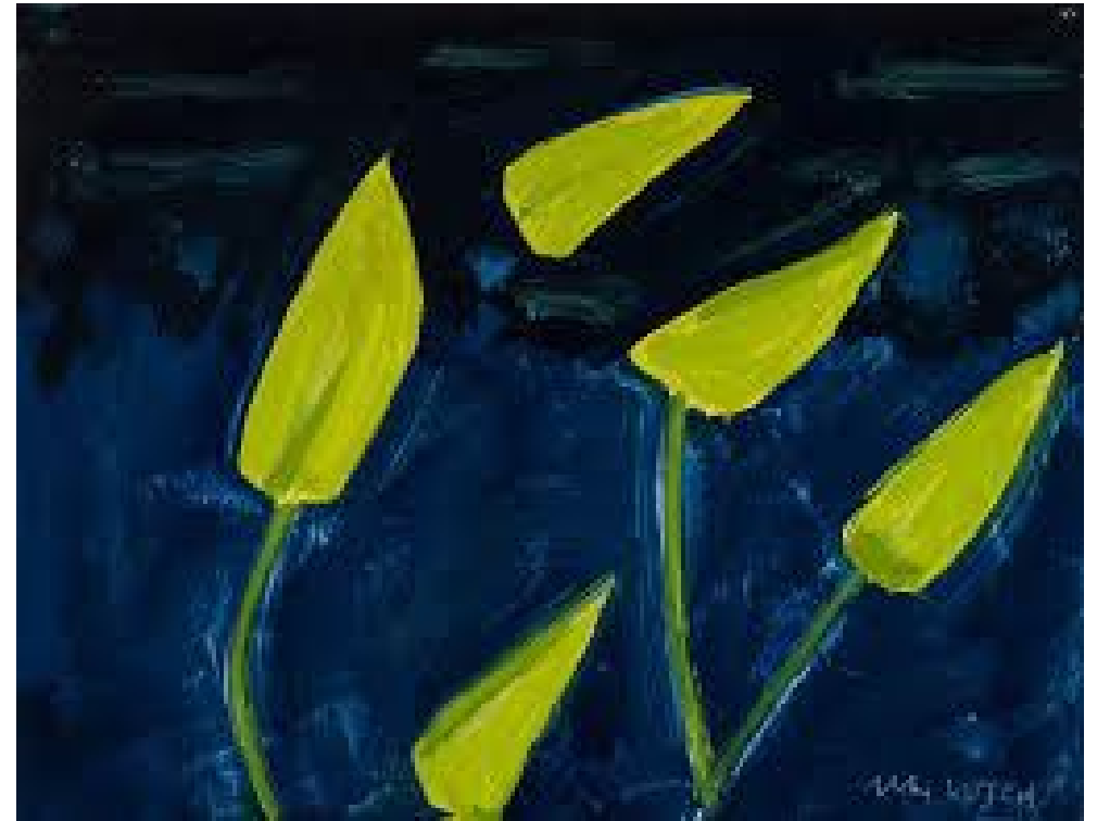
Painting by Alex Katz