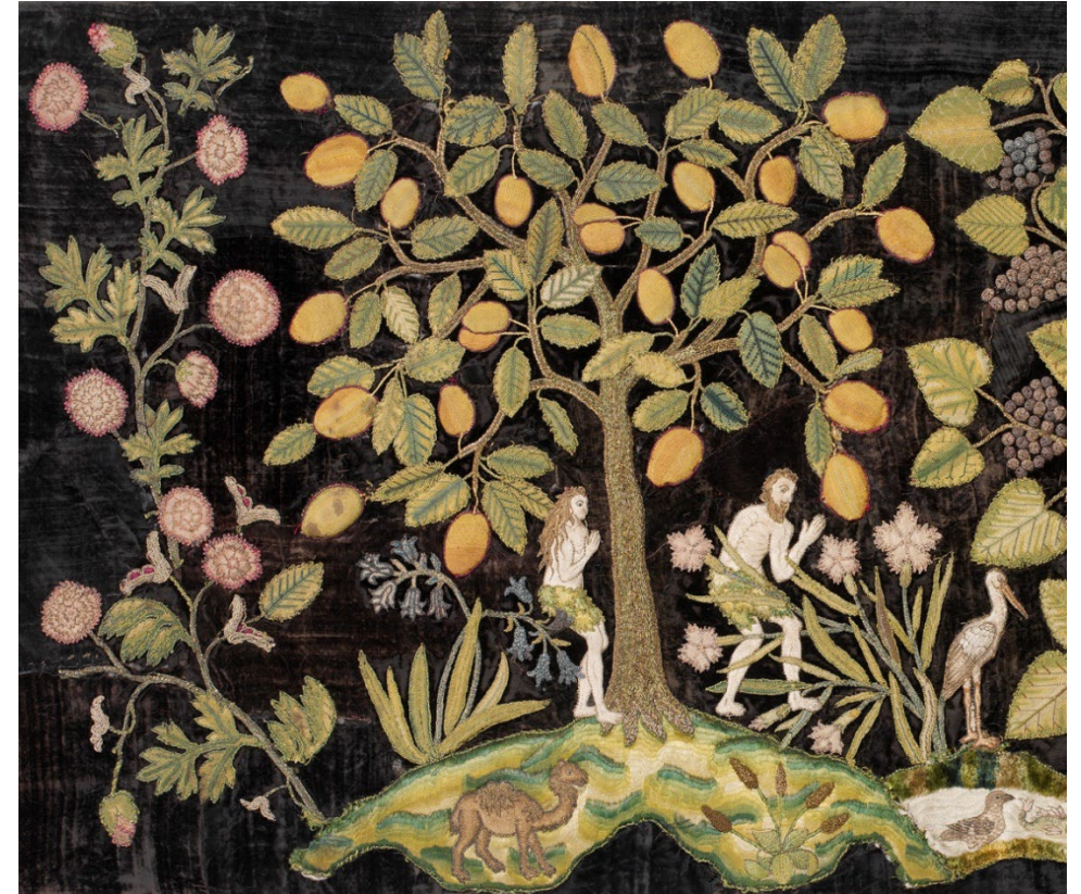
Late 15 th C. European Tapestry