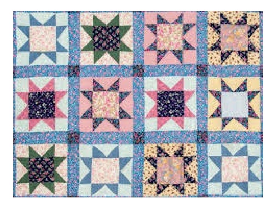
The Sewing Circle is offering sponsorships and sales of quilts and other Artisan pieces.